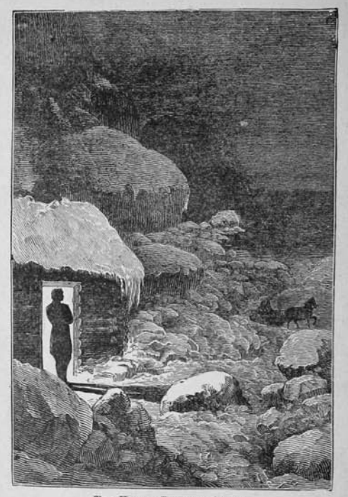
THE HUT AT BOULDER CREEK.