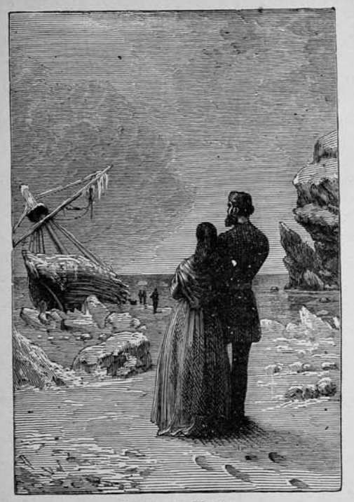
VISITING THE WRECK