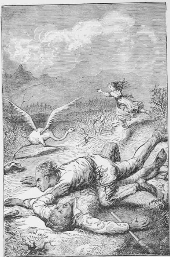
A WILD-GOOSE CHASE.